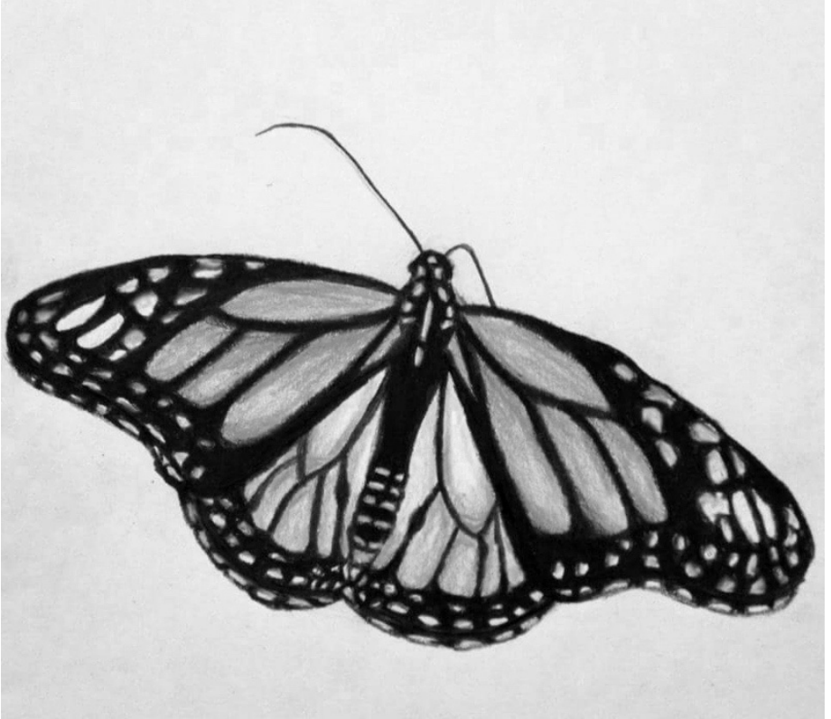
Freestanding image: large, centered, separate page.