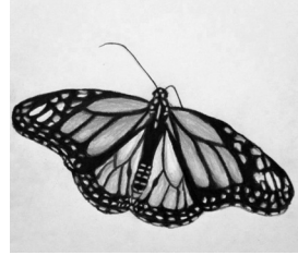
Photograph: small, right-justified.

Images come in four sizes in Vellum: small, small-medium, medium-large, and large. To do a full page image, the page with the image will have to be formatted and added outside of Vellum. Photographs can also be left-justified, centered, or right-justified. This is an example of how one might appear as a small image, right-justified at the top of a paragraph with the text wrapped around it. Photographs can be linked in the ebook versions. Captions and accessibility descriptions are included in this sample, but are optional choices.